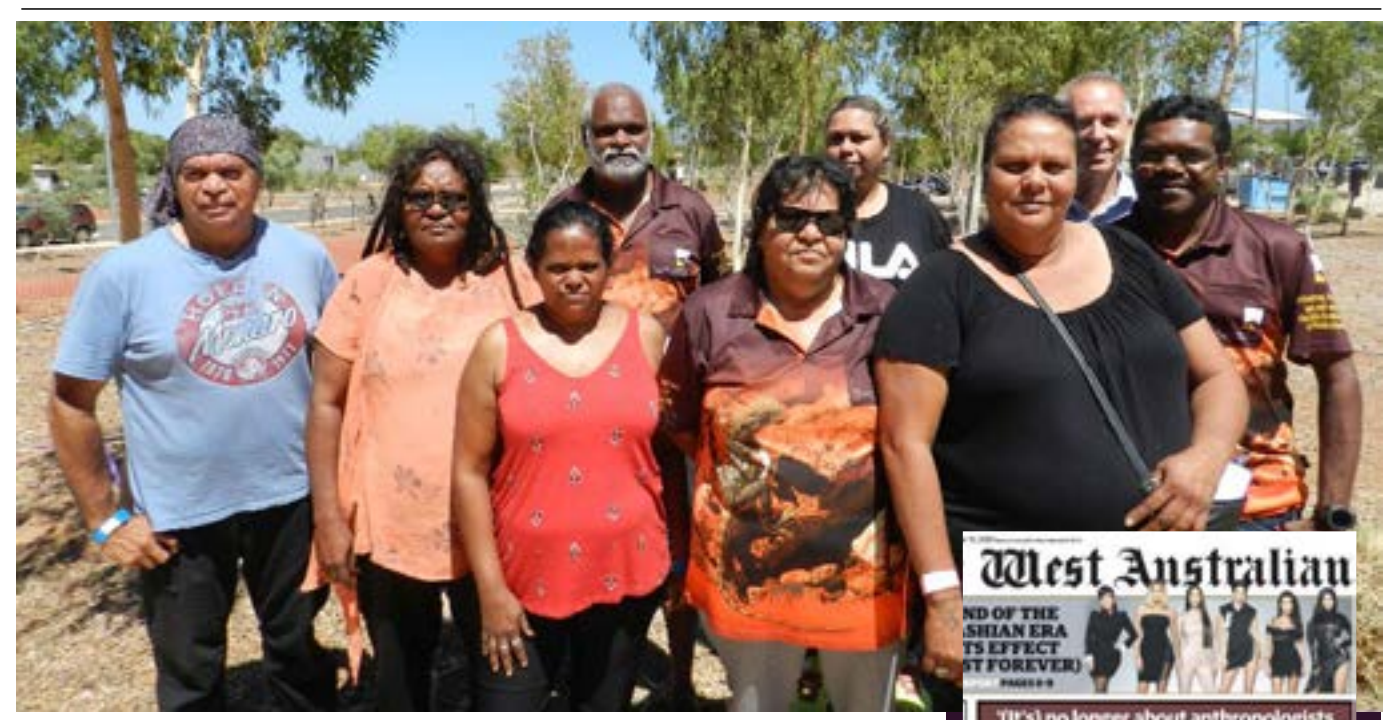
Puutu Kunti Kurrama and Pinikura Aboriginal Corporation