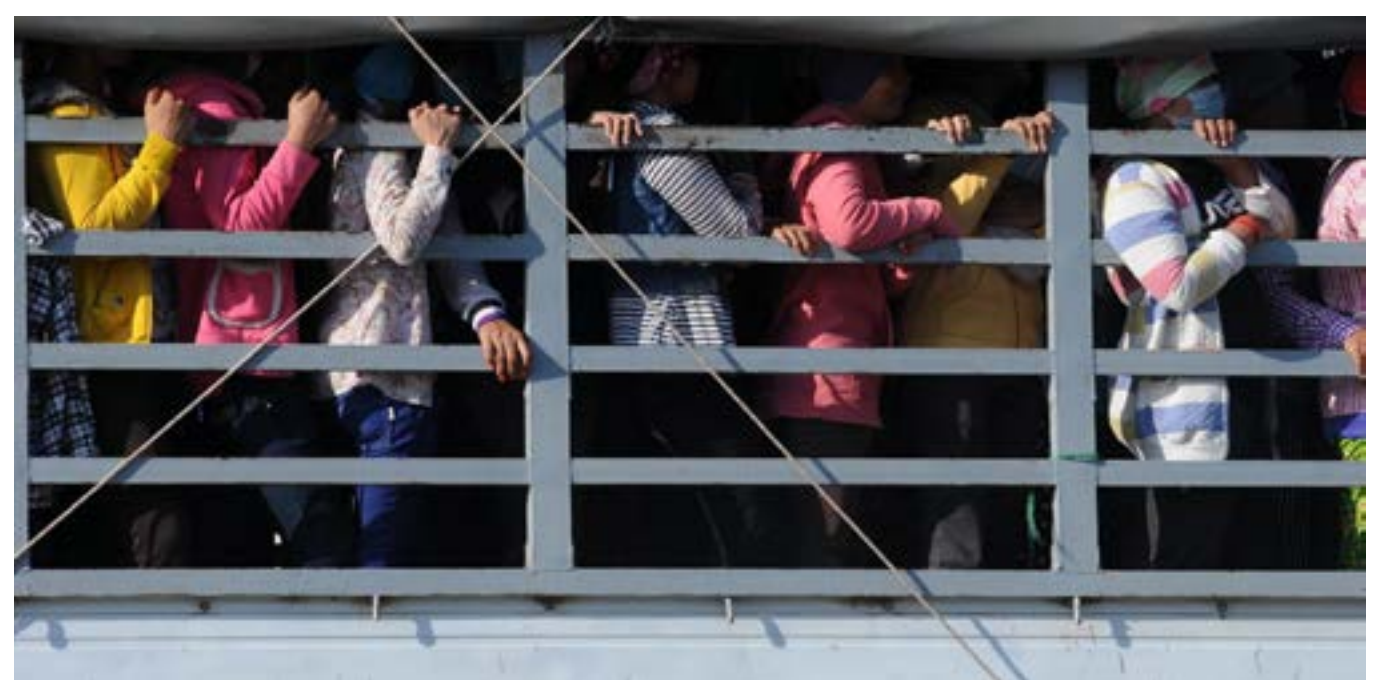
Garment workers overcrowded into the back of a truck, commuting home after work, Phnom Penh, Cambodia

The details of the CCLA engagement are to be decided, and the LAPFF consultation response on the proposed law on deforestation in the supply will be shared when complete. The Forum also held a